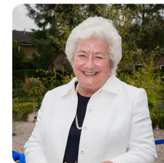
Baroness Harris of Richmond DL, PRESIDENT